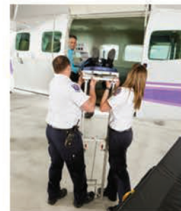
Patient being loaded into Caravan using Manual Patient Loader

1815 23rd Avenue North • Fargo, ND 58102