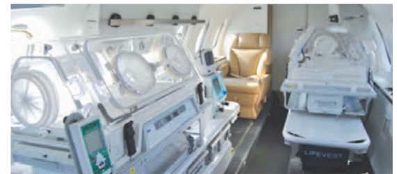
Incubator Transport system installed

1815 23rd Avenue North • Fargo, ND 58102