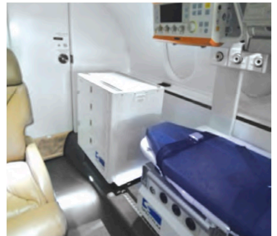
4-drawer cabinet installed