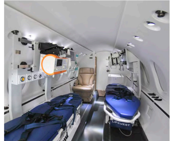
2200 Series Module, Dual Configuration. Composite Med Wall with Medical Equipment