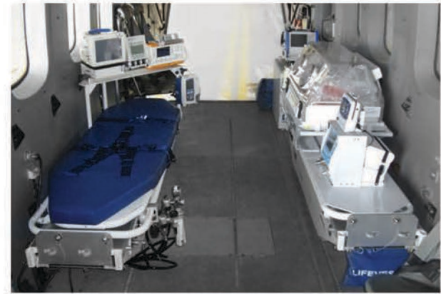
Single 2800 Series System Install and ITS Deck