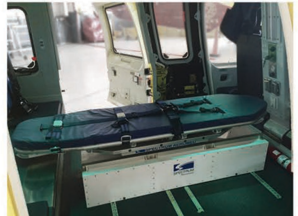
Pivot Stretcher and 3 Drawer Base

1815 23rd Avenue North • Fargo, ND 58102