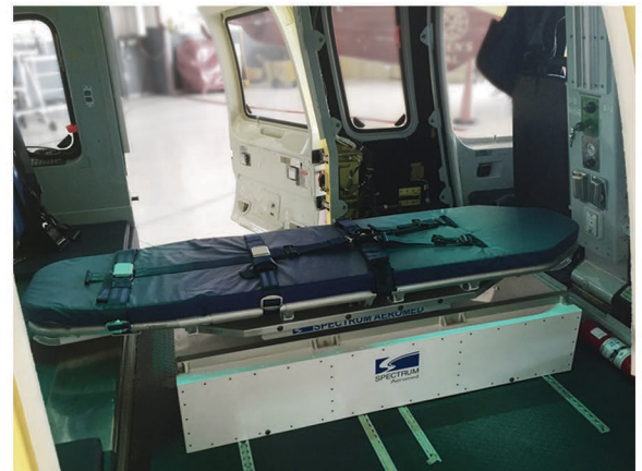
Pivot Stretcher and 3 Drawer Base

1815 23rd Avenue North • Fargo, ND 58102