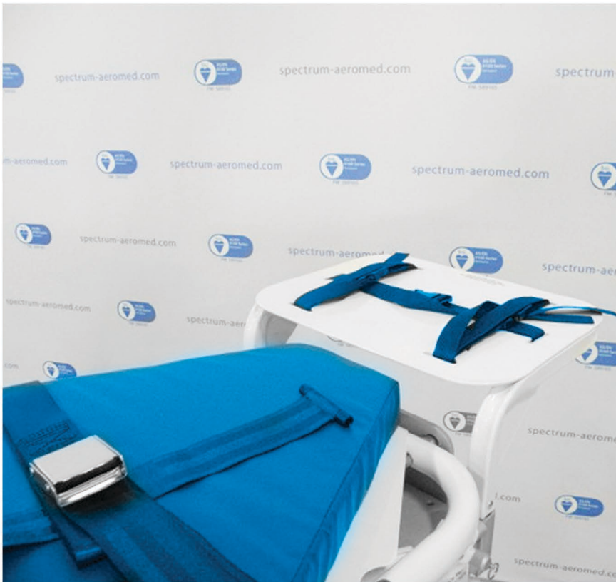
Equipment Table attached to 2800 Stretcher Module