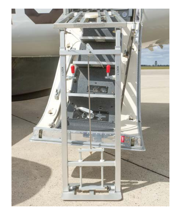
Manual loader on KA350