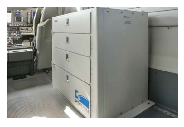
4-drawer cabinet installed