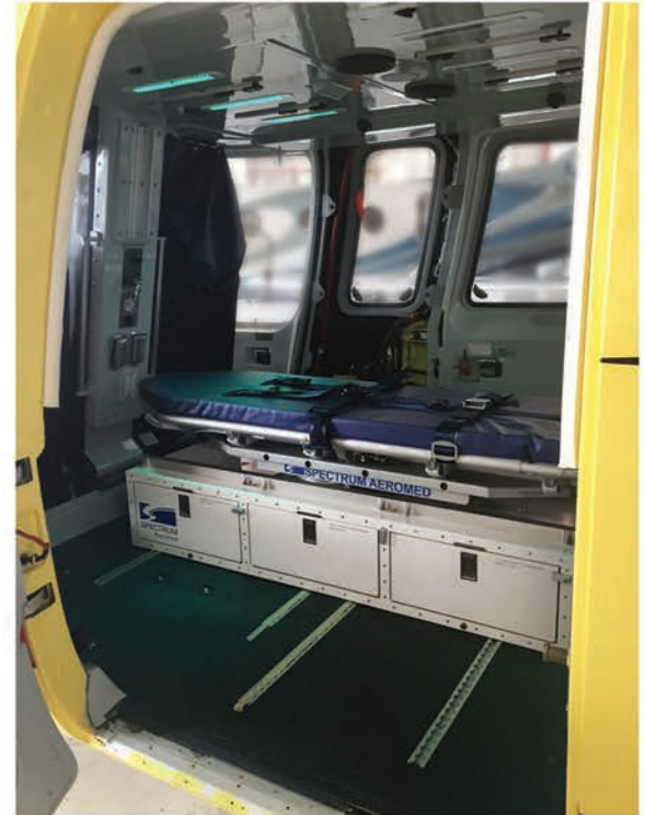
Pivot Stretcher and 3 Drawer Base