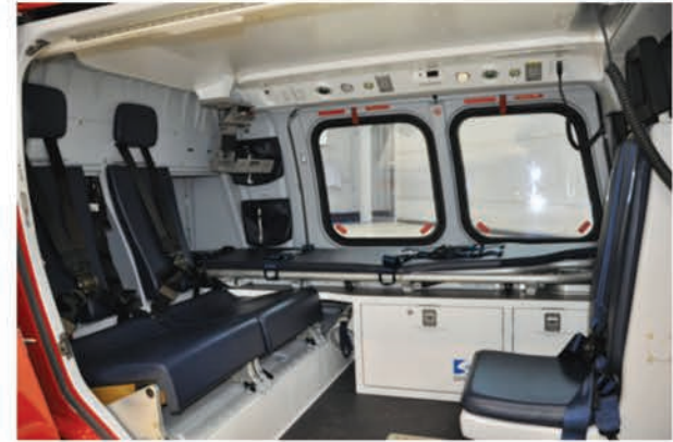
Stretcher and Base Installed