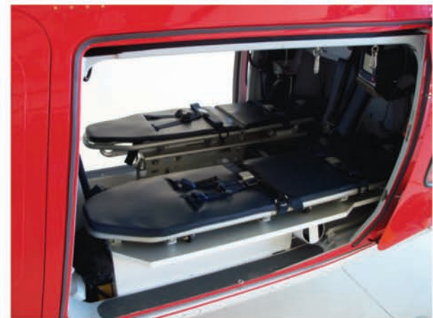
Main Base and Stretcher and Secondary Base and Stretcher Installed with Medical Attendant Seat

1815 23rd Avenue North • Fargo, ND 58102