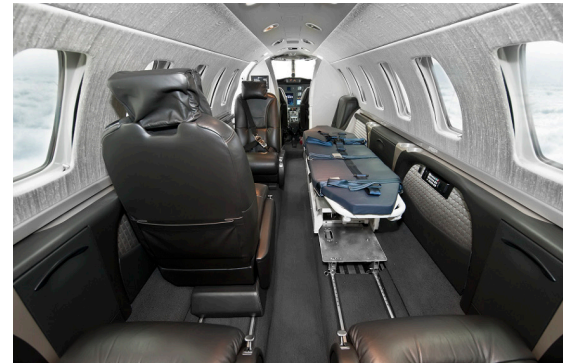
Stretcher and base installed