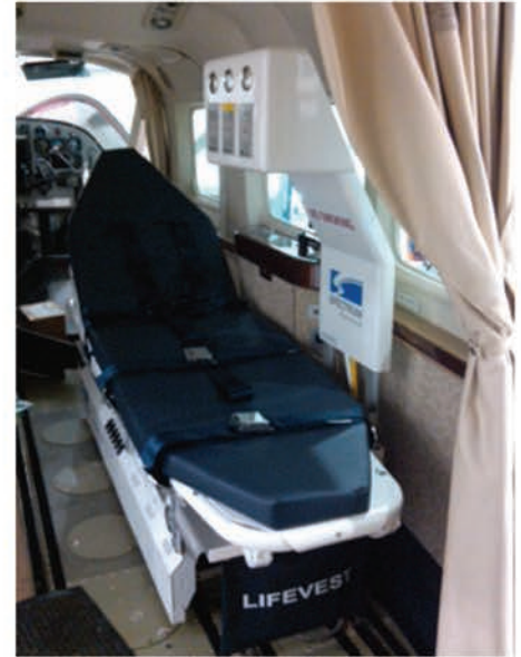
Cessna with Short Box System (20 series) installed