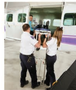
Patient being loaded into Caravan using Manual Patient Loader

1815 23rd Avenue North • Fargo, ND 58102