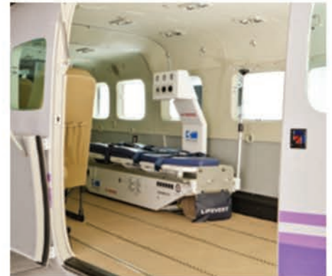
2800 Series Module Installed in 208B