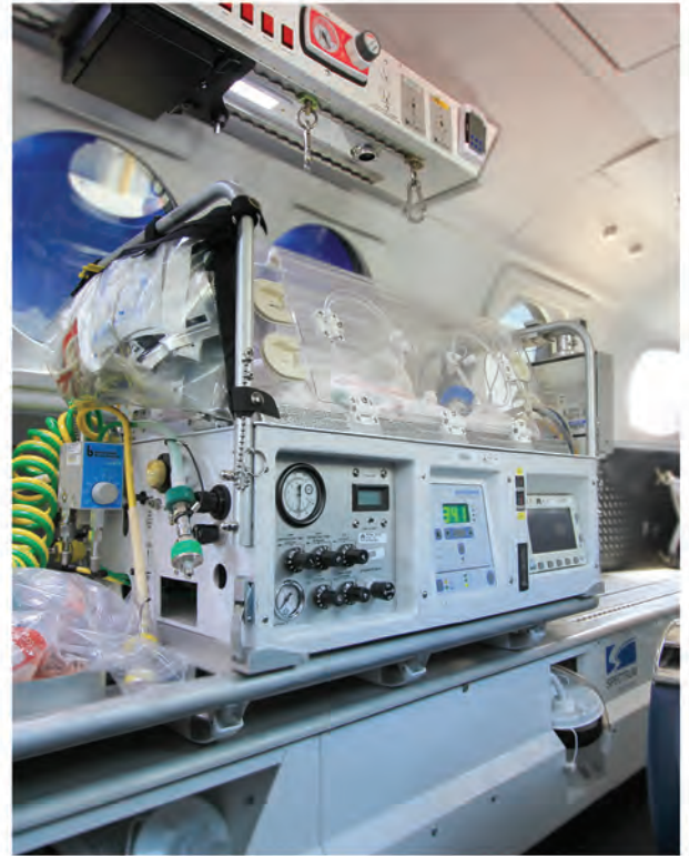
Infant Transport System (ITS) Deck