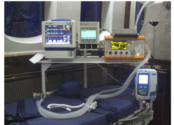
Infant Transport System attached

1815 23rd Avenue North • Fargo, ND 58102