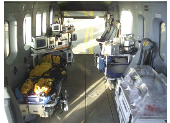
Stretcher on pivot – sliding into aircraft