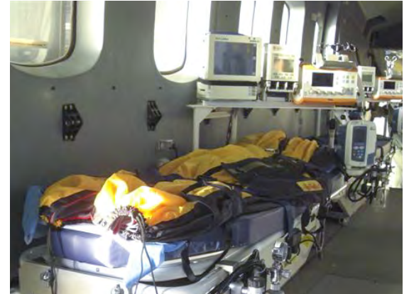
Equipment rack installed