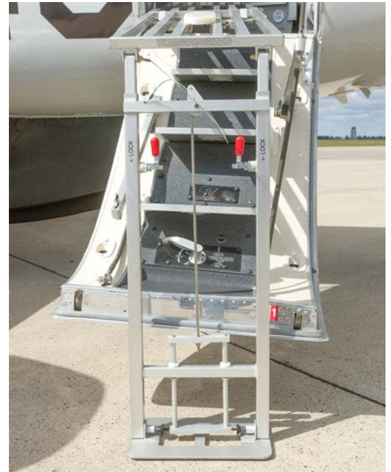
Manual loader on KA350