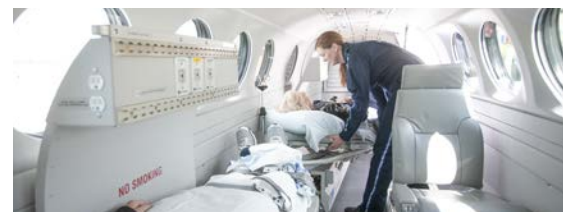
Dual Installation Right Side

1815 23rd Avenue North • Fargo, ND 58102