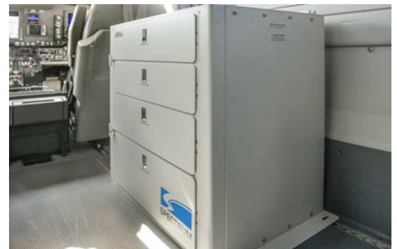
4-drawer cabinet installed