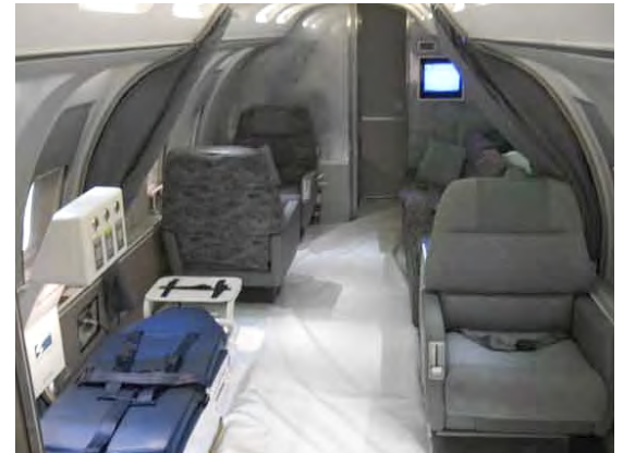
2800 Module right-hand installation