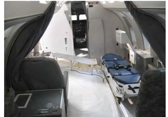
2800 Module right-hand installation