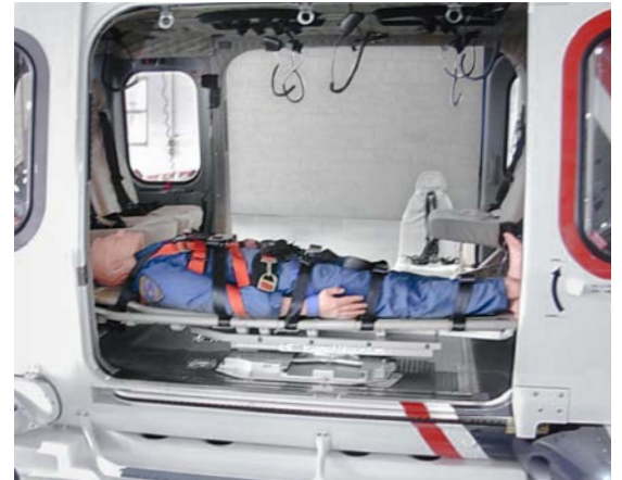
Pivot base installed longitudinally and laterally in the aircraft.