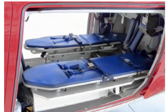
Main base and stretcher and secondary base and stretcher installed with Medical Attendant Seat.

1815 23rd Avenue North • Fargo, ND 58102