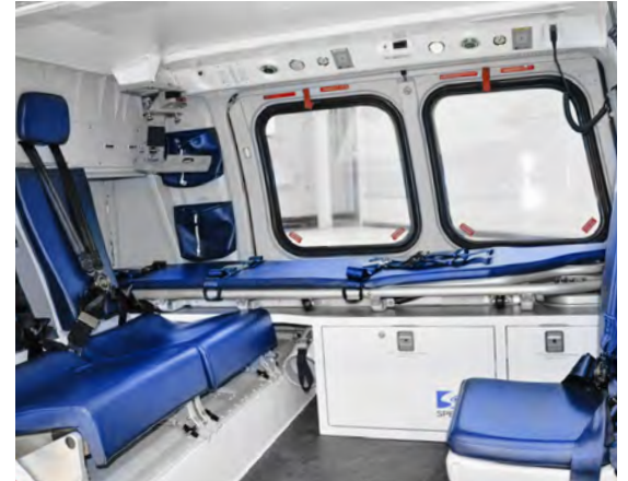
Stretcher and base installed