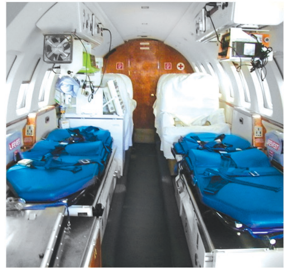
Dual dedicated configuration