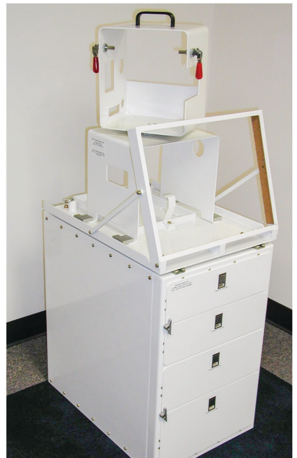
4 drawer cabinet

1815 23rd Avenue North • Fargo, ND 58102