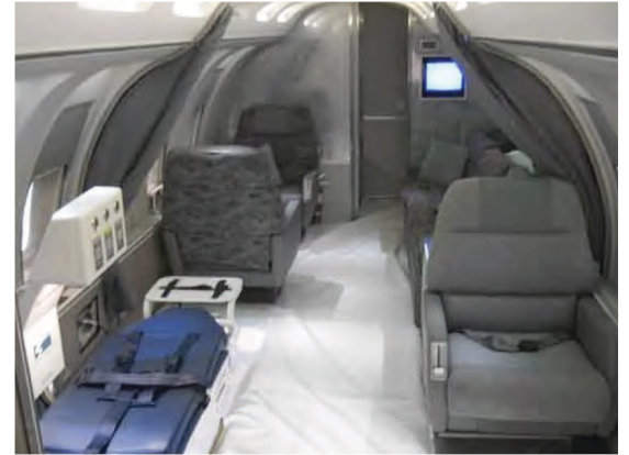
2800 Module right-hand installation