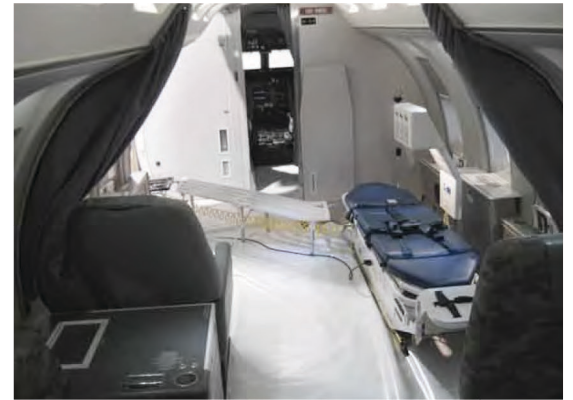
2800 Module right-hand installation