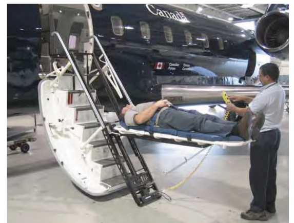
Loading patient with Electric Loader

1815 23rd Avenue North • Fargo, ND 58102