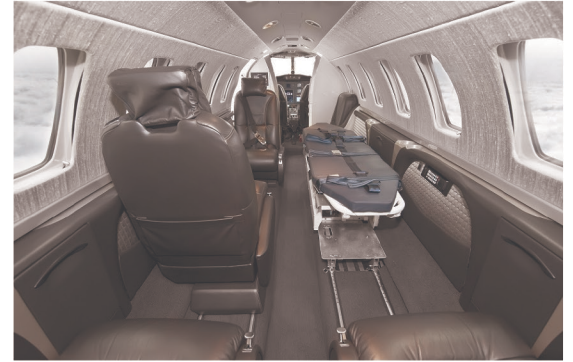
Stretcher and base installed