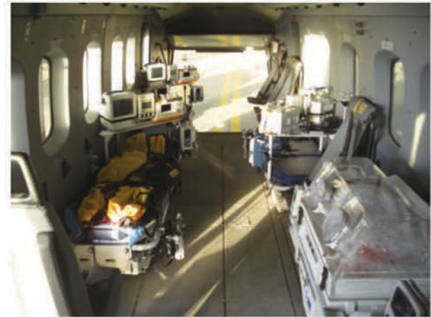
2800 Series with ITS Deck installed