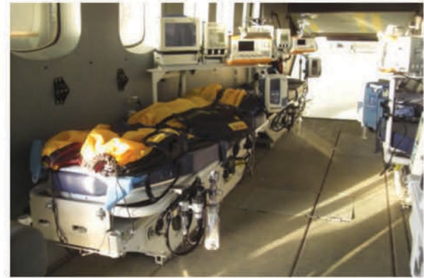
Equipment rack for 2800 Series installed