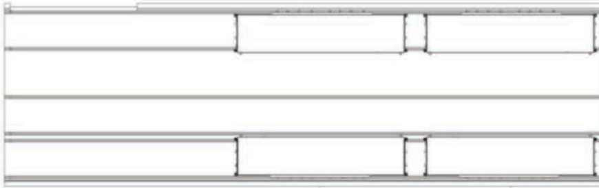
S-92 Configuration with 4 Medical Systems

Spectrum Aeromed is recognized as a world leader in creating customized and durable, highly functional air medical transport equipment that complies with aviation regulations. All engineering and design of our air ambulance life support systems comes from working hand-in-hand with air medical personnel worldwide.