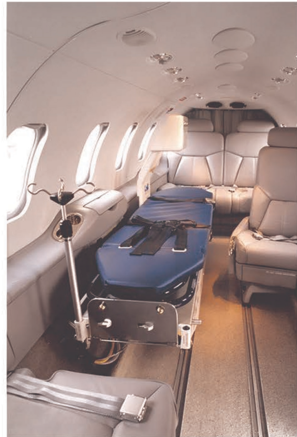
2800 Series System Install