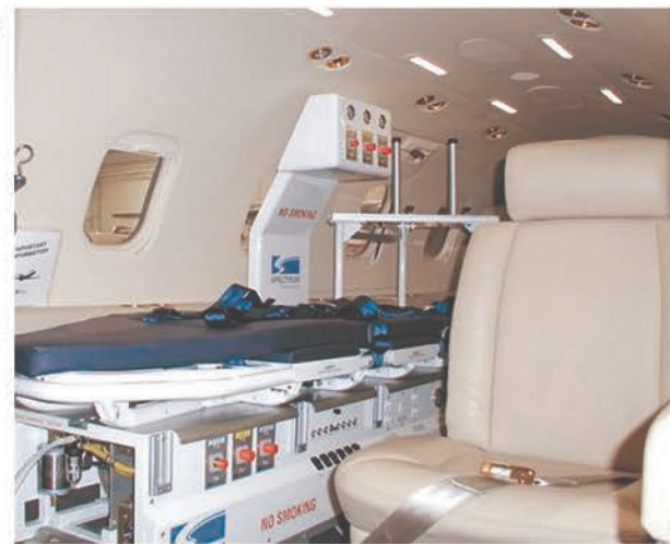
20 Series System Install

1815 23rd Avenue North • Fargo, ND 58102