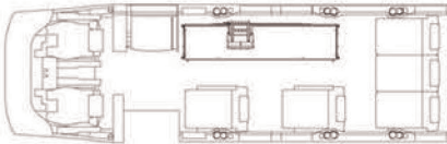
Single 2800 Series System Install