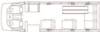
Single 20 Series System Install without Overhead